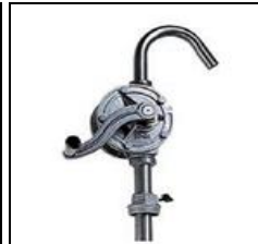
Metal Rotary Pump