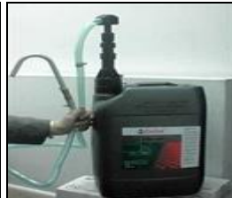
Plastic Lift Pumps