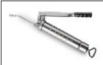
Grease Guns & Pumps